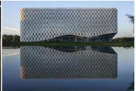
Lecture room in the library building